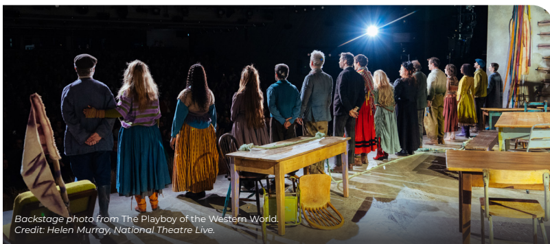
Backstage photo from The Playboy of the Western World .